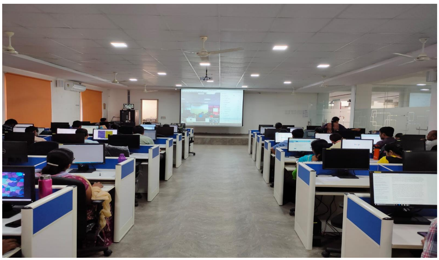
Figure 4 Participants listening to the lectures