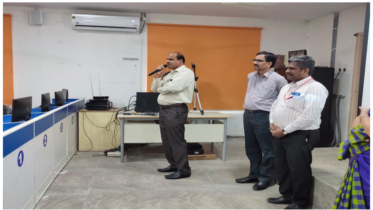
Figure 6 Valedictory Function