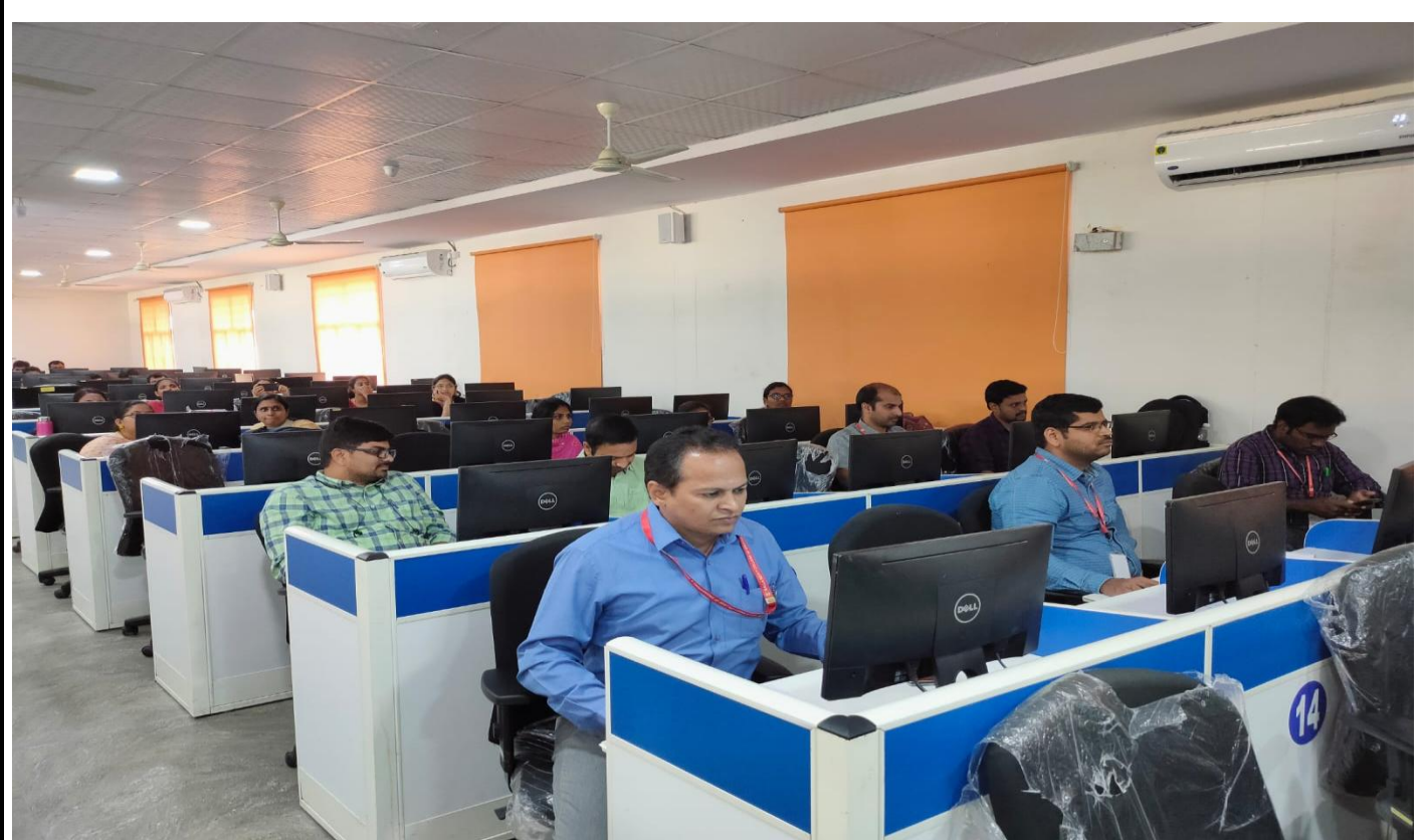
Figure 5 Particpants working on Assignments